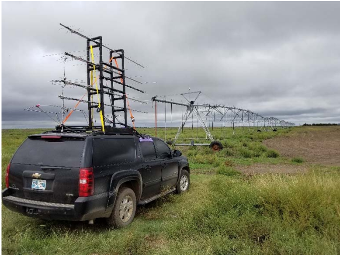
The NØLD/R machine at their starting spot in DM97xx, north of Dodge City, KS, competing with a large piece of irrigation equipment.