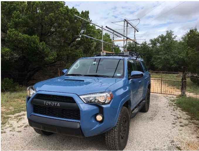
KG5UCA/R (Classic Rover, Ops: KG5UCA and K5TR) ready to head out from the K5TR QTH to 12 grids in Texas.